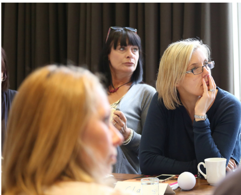
MHFAiders participating in a training session

“Teachers perform extremely challenging roles and it’s important to be able to cope with what are sometimes distressing circumstances. We’re also more supportive of each other now.”